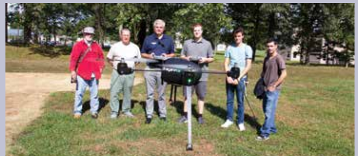
Aviation and Drones