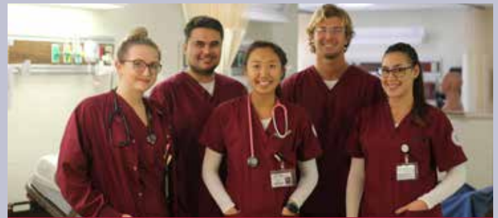
Nursing and Health Sciences