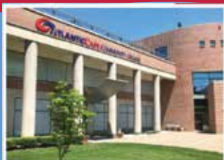
Cape May County