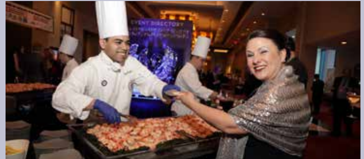
Academy of Culinary Arts